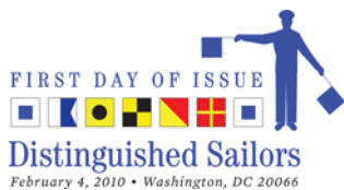
Digital Color Pictorial

Distinguished Sailors Stamp Special Cancellations PO Box 92282 Washington, DC 20090-2282