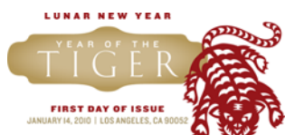
Digital Color Pictorial

After applying the first day of issue postmark, the Postal Service will return the envelopes to the customer by U.S. Mail.